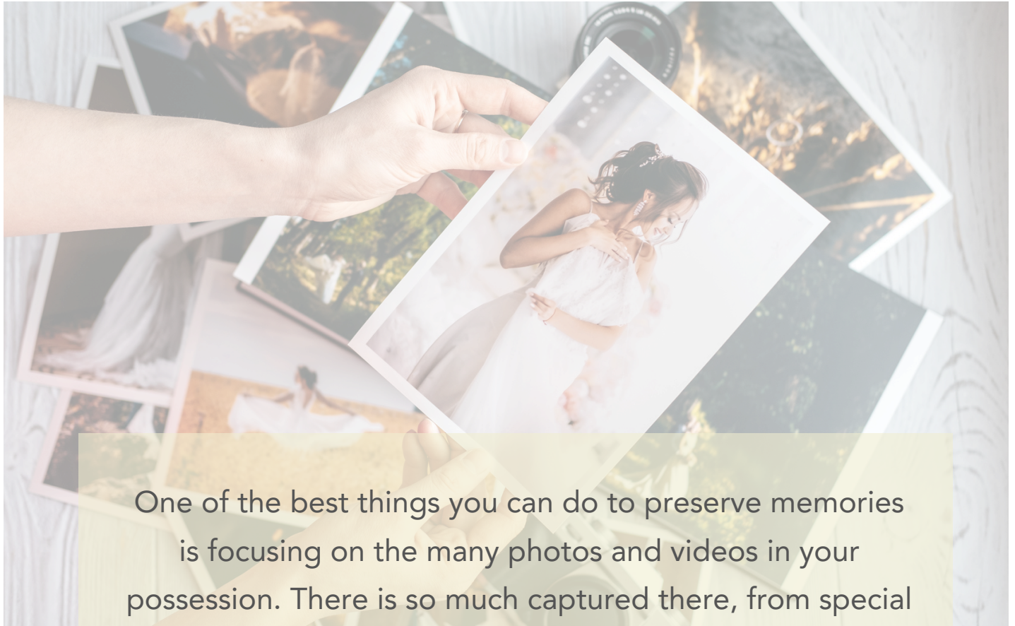
PHOTO ORGANIZING Checklist

One of the best things you can do to preserve memories is focusing on the many photos and videos in your possession. There is so much captured there, from special occasions to important moments and a chronology of your life. In fact you'll find that what you have captured in photo and video form releases you from any need to save most of the 'sentimental' things you have kept that take up so much room in your home.